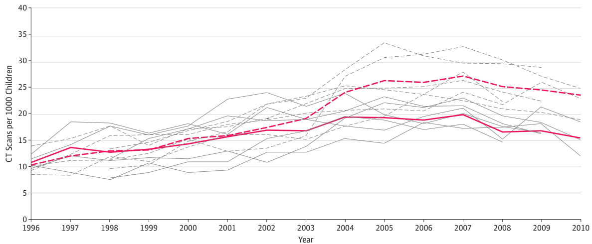
Figure 1. Trends in the Use of Computed Tomography (CT) Over Time, by Age Group and Health Care System

The solid lines show rates for children younger than 5 years of age; the dashed lines show rates for children 5 to 14 years of age. The gray lines show rates at each health system, and the red lines show the average rates across health systems.